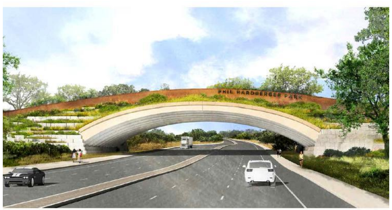
IL HARDBERGER PARK Enlarge

The land bridge at Hardberger Park which crosses over Wurzbach Parkway.