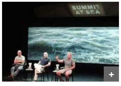
SUMMIT AT SEA 2015