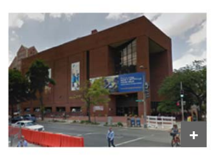
Bisnow Scoop: Akridge Acquires YMCA in Dupont Circle