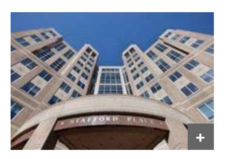
Jamestown Buys NSF HQ in Ballston