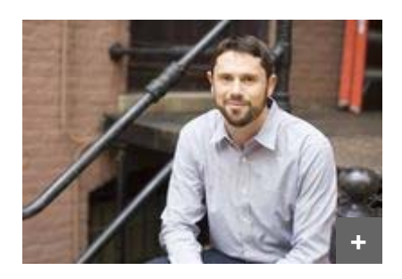
Fundrise Launching Online REIT, Sets Goal of $50M