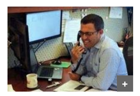
Better Business Practices When Forming a Senior or JV Partnership