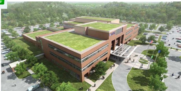
Department of Veterans Affairs

An artist's rendering of the Butler VA health care facility planned for Center.