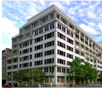
901 E Street $117,600,000 257,547 square feet April 2006