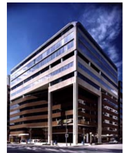
1400 Eye Street $41,500,000 167,233 May 2006