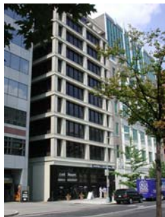
1331 H Street $20,624,000 75,271 square feet April 2006