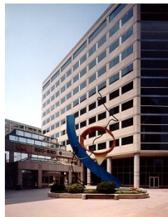
830 1 st Street $77,250,000 236,722 square feet May 2006