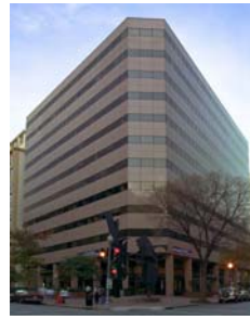
1101 Vermont $60,000,000 164,402 square feet April 2006