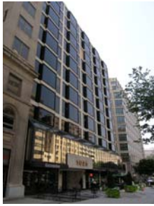
1025 Vermont $34,050,000 113,781 square feet January 2006