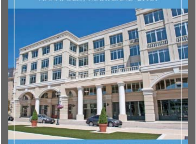
51,000 SF FIRST CLASS SPACE AVAILABLE OFFICE, MEDICAL AND RETAIL OPPORTUNITIES

THREE PARK PLACE ANNAPOLIS, MARYLAND 21401